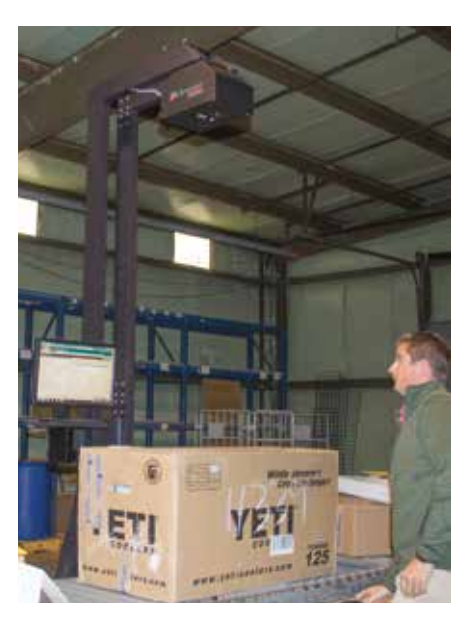
Installed over their pre-existing conveyor line, iDimension 300 streamlines dimensions, package images and weight data with third-party postal software to ensure the most cost-effective shipping.

iDimension 300 is a 3D imaging and sensing technology system that instantly